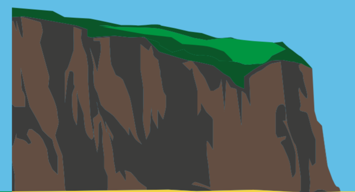
CLIFFS AT NEWGALE CLOGWYNI YN NIWGWL 50 - 70m